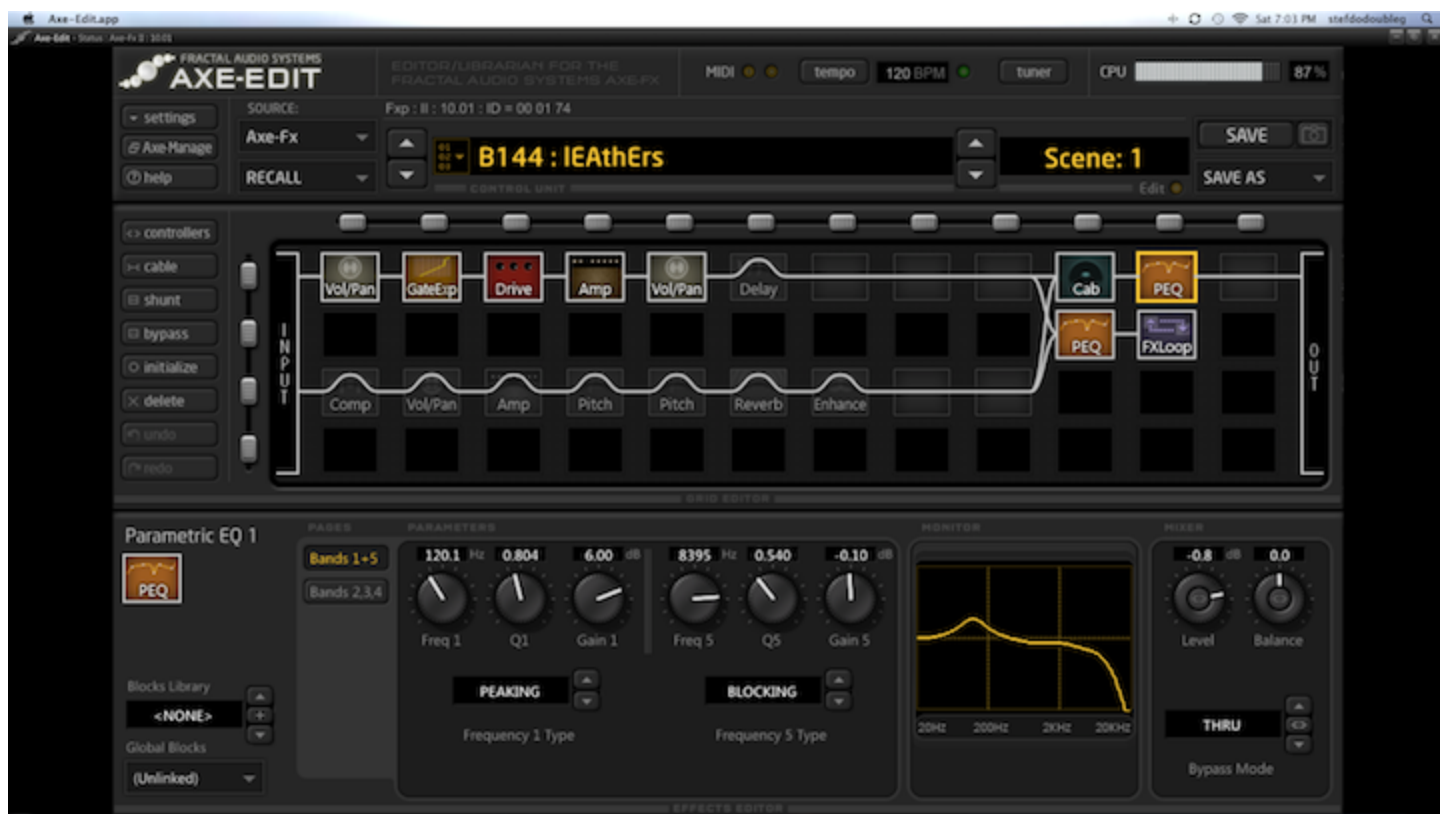
Leathers - Scene 1 - Amp Sim 1 - FAS Modern Description: Heavy Tone