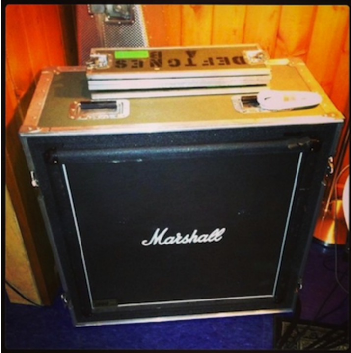
Marshall 1960B with 100 watt Celestian speakers.