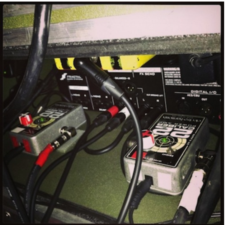
(Left) Main rig 1 with 2 Palmer PDI-CTCs for FOH out. (Right) Two Electro-Harmonix .22 Caliber “poweramps”.