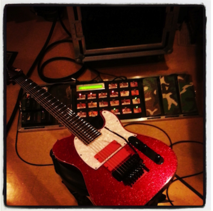
Red ESP Tele with custom 8 string Floyd Rose.