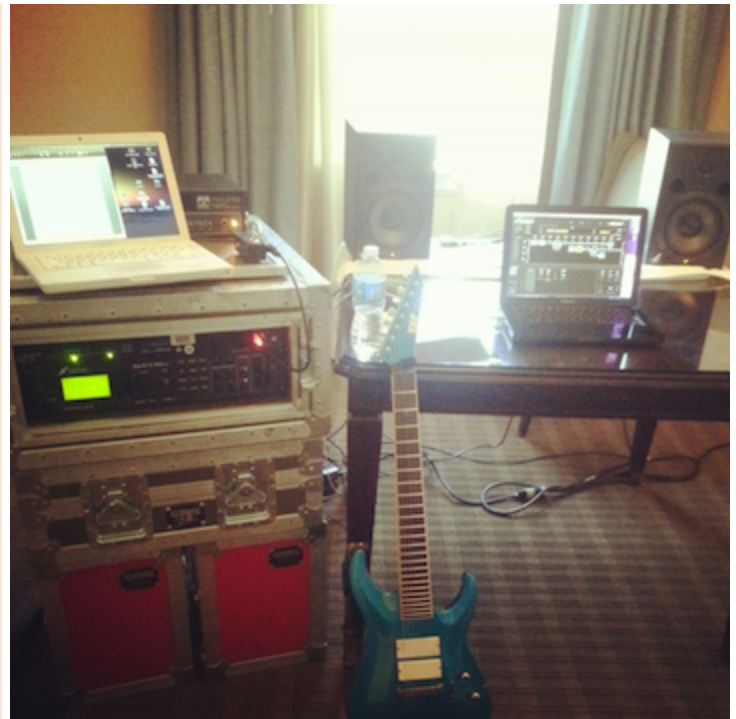
Pic of us tweaking presets out on the road in a hotel room. We almost got asked to leave...