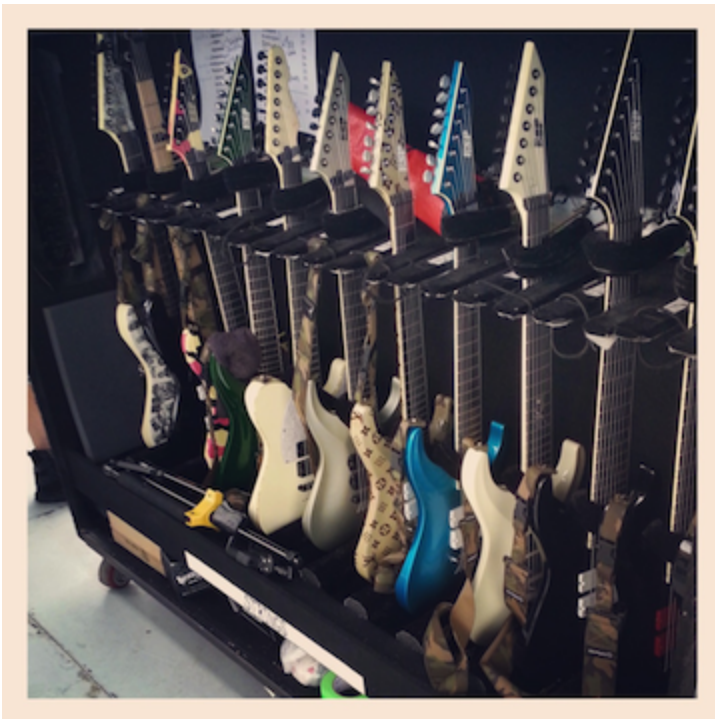
My guitars on tour, "A rig" collection.