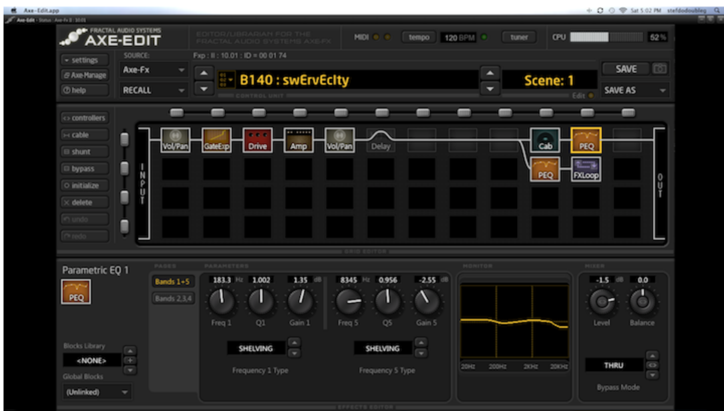
Swerve City - Scene 1 - Amp Sim 1 Euro Uber Description: Heavy Tone