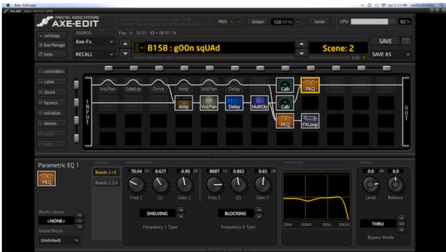
Scene 2 - Another stock factory pre I loved, "Black Hole".